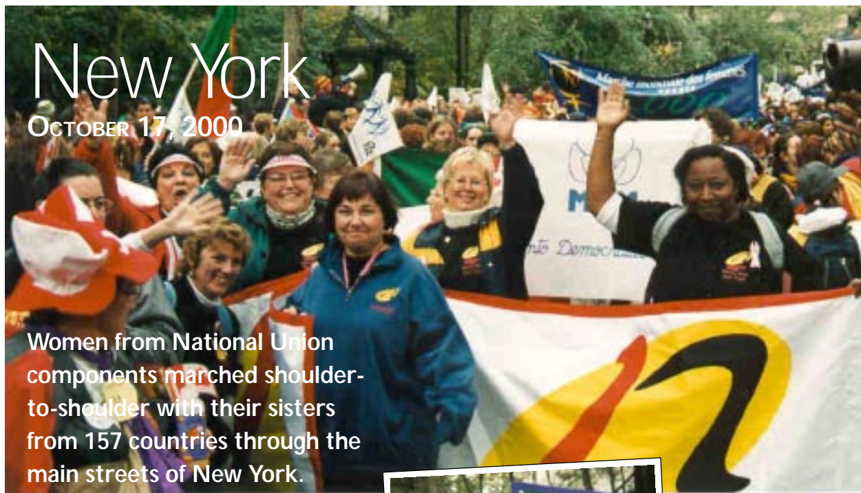
Women from National Union components marched shoulder-to-shoulder with their sisters from 157 countries through the main streets of New York.

Women from around the globe gathered at the United Nations to present their demands in efforts to end poverty, to end violence, to end discrimination, to have more social housing, to increase Old Age Security payments, and other demands of utmost urgency to provide women with opportunities for better health and standards of living.